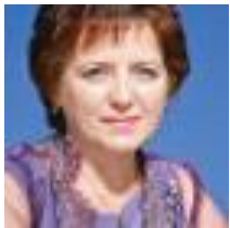
Izabella Krasnova / Pianist